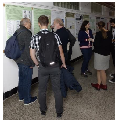
Institute of Hydrology of SAS, Dúbravská cesta 9