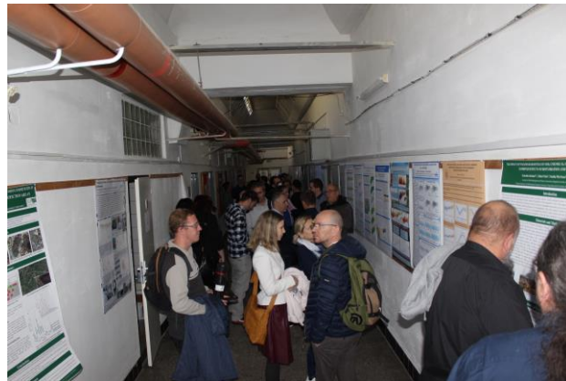
Institute of Hydrology of SAS, Dúbravská cesta 9