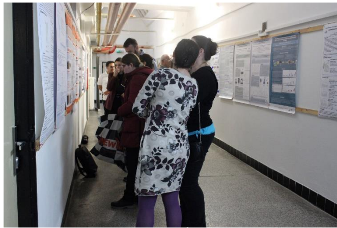
Poster day Conference 2023 and 2024